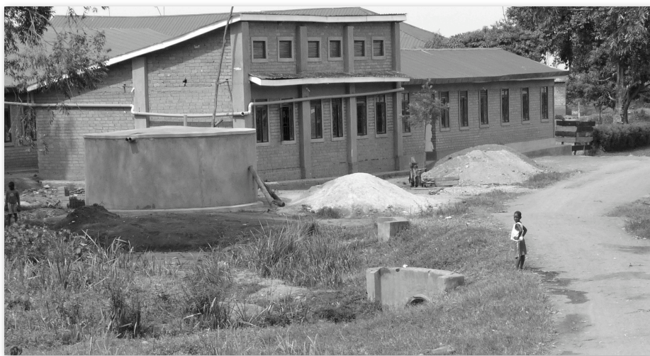
The Nursery School is nearly complete. In the foreground, a huge water tank for holding collected rainwater from the classroom roofs. Much of the finishing work is being guided by Sean Cashin.