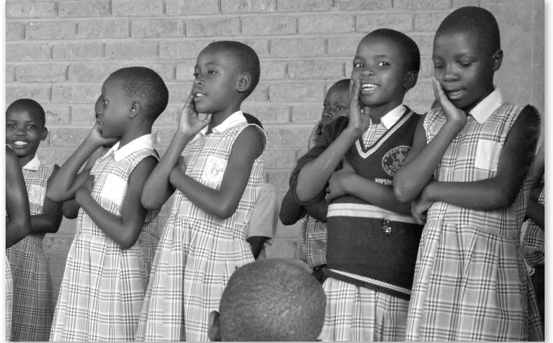
Primary-4 students entertaining their schoolmates and American visitors at a party honoring new students and staff at MSA.