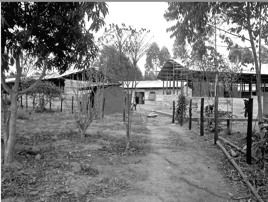
Top: The new "Green Campus" with 7 classrooms for all primary classes in two buildings, 3 classrooms for the secondary school, an administration building and latrines will serve over the next few years as the master plan is developed on the surrounding property.

Partnership: Imagine joining with other non-profits to embrace the common vision of self-sustaining programs that can "break the cycle of poverty." Mustard Seed's school motto is "We can move mountains!" And look—it's happening.