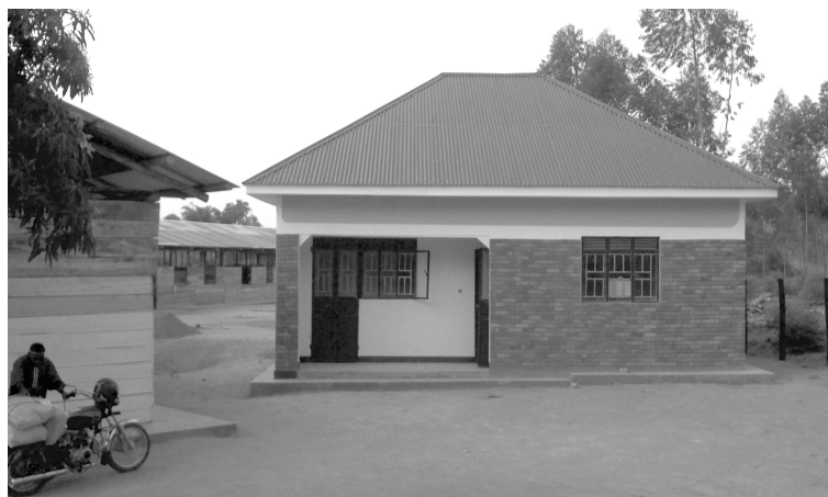
The new administration building anchors the transitional campus. It contains two offices for head masters and staff rooms for both primary and secondary schools.

Here are some of the reasons why supporting Real Partners Uganda made sense to over 400 individuals, churches, civic organizations, and foundations during 2013.