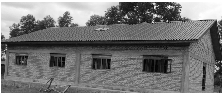
"Judy's House," the new girls dormitory on the Green Campus. Both Primary 7 and Secondary 4 girls are staying in this fine, new building that has 8 large bedrooms.