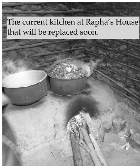
The current kitchen at Rapha's House that will be replaced soon.

The "Christmas in September" offering for food packages was a huge success, with over 550 gifts being given out on Dec. 23, 2015, creating much joy and excitement. Many thanks to the churches that participated. The gift of food was particularly important this year because the Christmas break was extended for national elections. When kids are not in school, poor families struggle to feed their children.